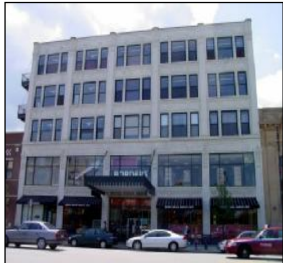
The restoration of the Old Goldblatt's Building near the corner of Broadway and Lawrence includes a Border's Book Store and other retail space as well as affordable homes.

If such a policy had been in place from 1998 to 2003 for all developments of 10 or more units (new construction or condos), we would have created nearly 8,000 new affordable homes for working class people in Chicago and/or received millions of dollars in fee payments from developers. 44 These fee in lieu payments would have gone to the City of Chicago's highly successful Low Income Housing Trust Fund, which allows landlords to rent apartments to low-income seniors and the working poor.