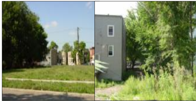
The above vacant properties are located in Lawndale, a neighborhood on the west side of Chicago--and represent just two of the many vacant lots in Lawndale alone.