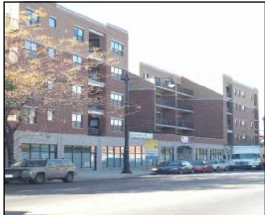
Logan View—New development in the heart of Logan Square where no new affordable housing units were built. Two-bedroom units start at $297,000.