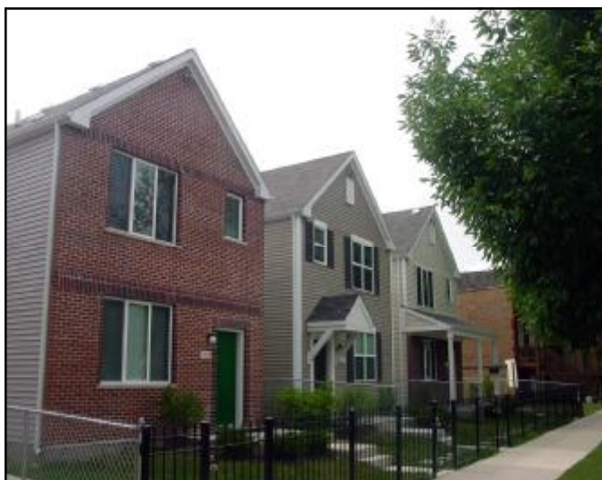
A view of the EZRA Homes—100 affordable single family homes located in Lawndale neighborhood on Chicago's west side.

If the city is ever to rebuild its devastated areas, critical masses of land must be assembled and dedicated to