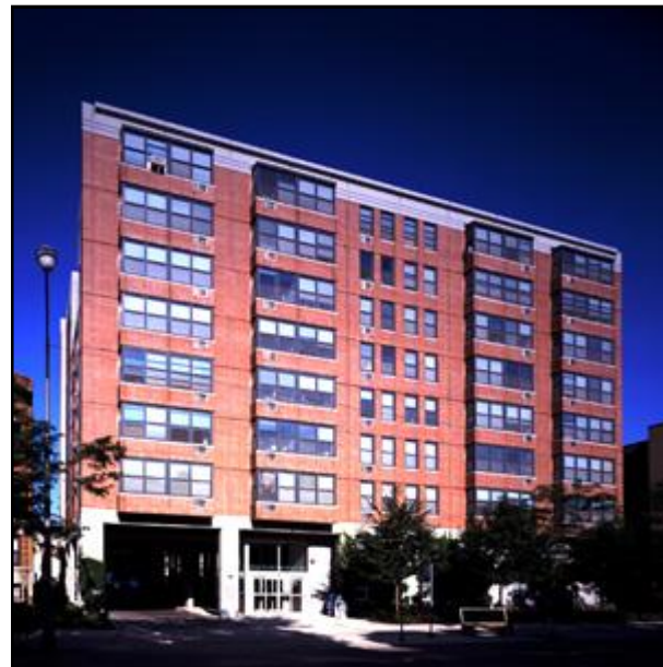
The Ruth Shriman House located near the corner of Irving Park and Sheridan Road, provides 88 of affordable housing units for seniors.

Mayor Daley likes to think of himself as "The Housing Mayor." A press release issued this past June by the Office of Governor Rod R. Blagojevich stated, "Under the leadership of Governor Blagojevich, Illinois is now one of the most progressive states in the nation in regards to affordable housing." 40 But the numbers and statistics presented thus far paint a much different picture. United Power thinks that the city and state could do much more to invest in affordable housing. Any local government that wishes to address the need for housing must put its own resources towards that priority. In the city, this means money, land, and requirements on private development. At the state level, this means money.